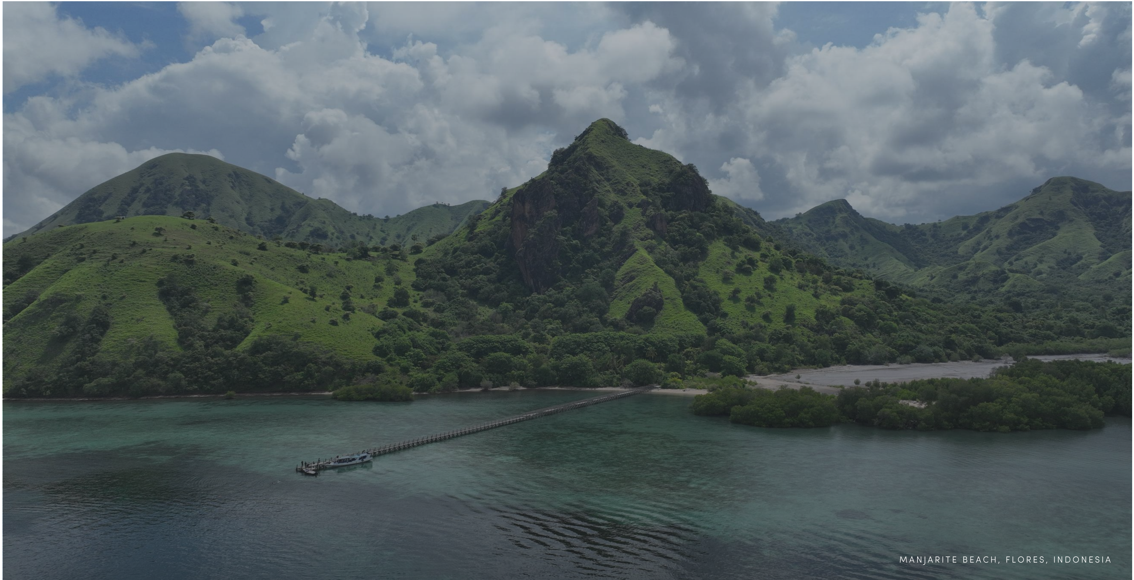
MANJARITE BEACH, FLORES, INDONESIA