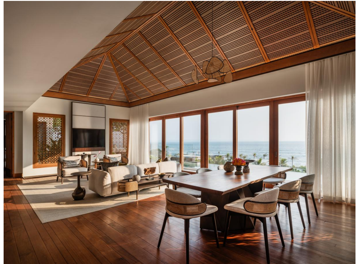
TWO BEDROOM OCEAN VIEW POOL PENTHOUSE