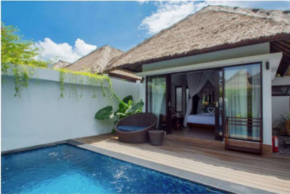
One Bedroom Private