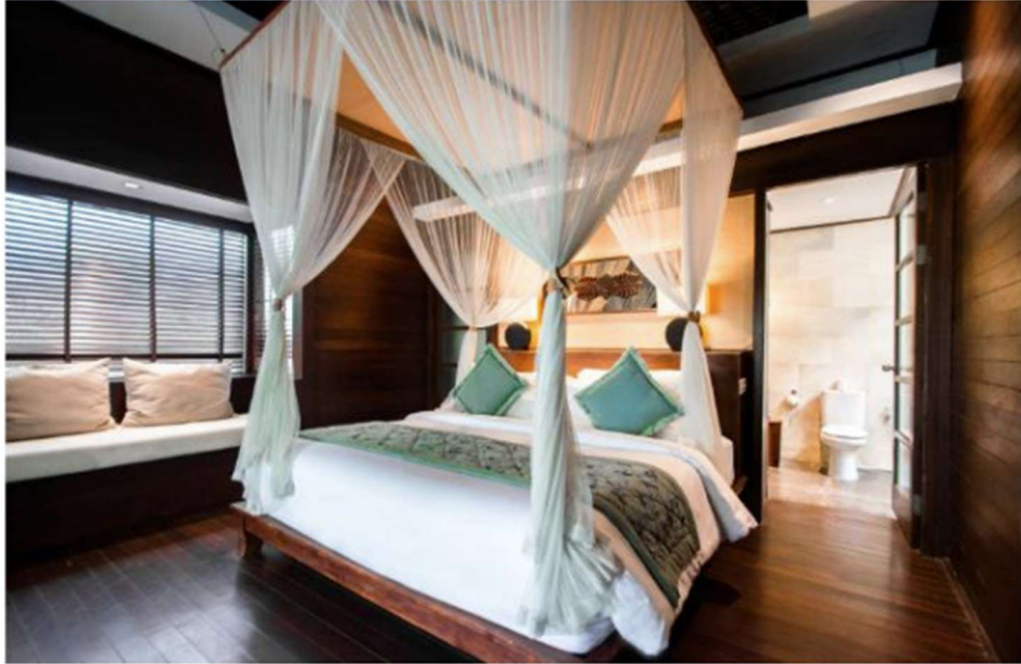
One Bedroom Garden