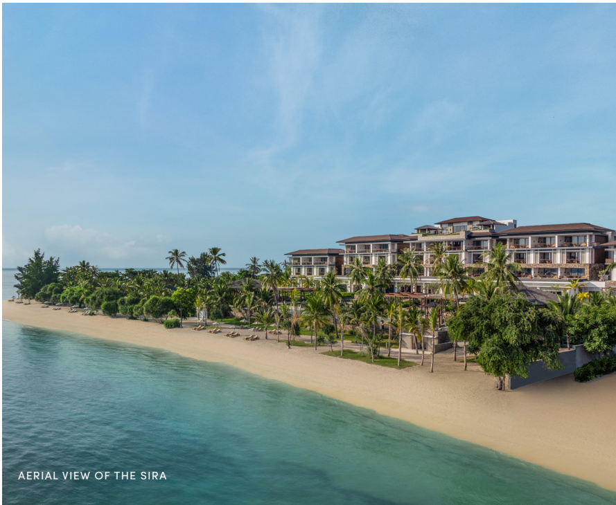
AERIAL VIEW OF THE SIRA

A luxurious library bar setting for a glamorous cocktail, aperitif or an indulgent nightcap