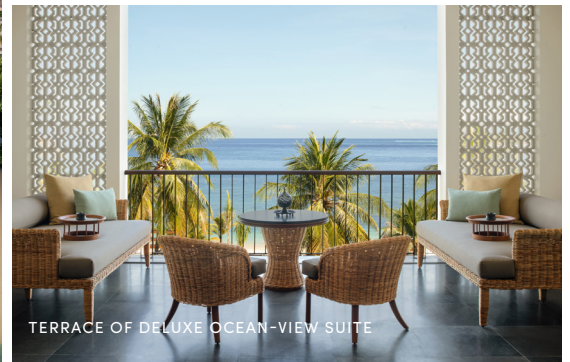
TERRACE OF DELUXE OCEAN-VIEW SUITE

THE SIRA, A LUXURY COLLECTION RESORT & SPA, LOMBOK