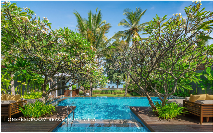
ONE-BEDROOM BEACHFRONT VILLA