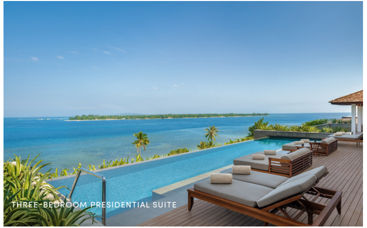
THREE-BEDROOM PRESIDENTIAL SUITE