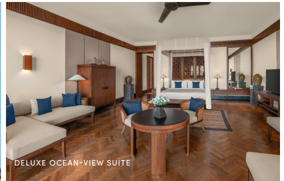
DELUXE OCEAN-VIEW SUITE