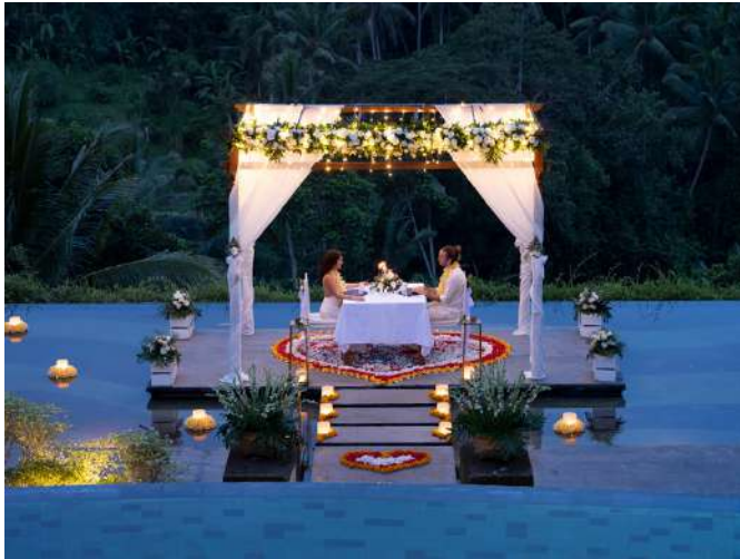
Romantic Dinner Under The Stars