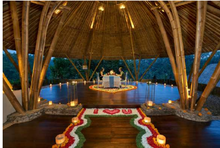
100 Candles Romantic Dinner