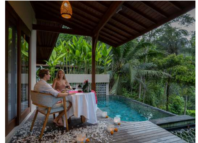
Splendid Poolside Romantic Dinner