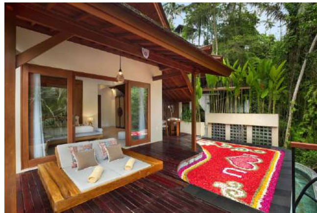
Flower Pool Decoration