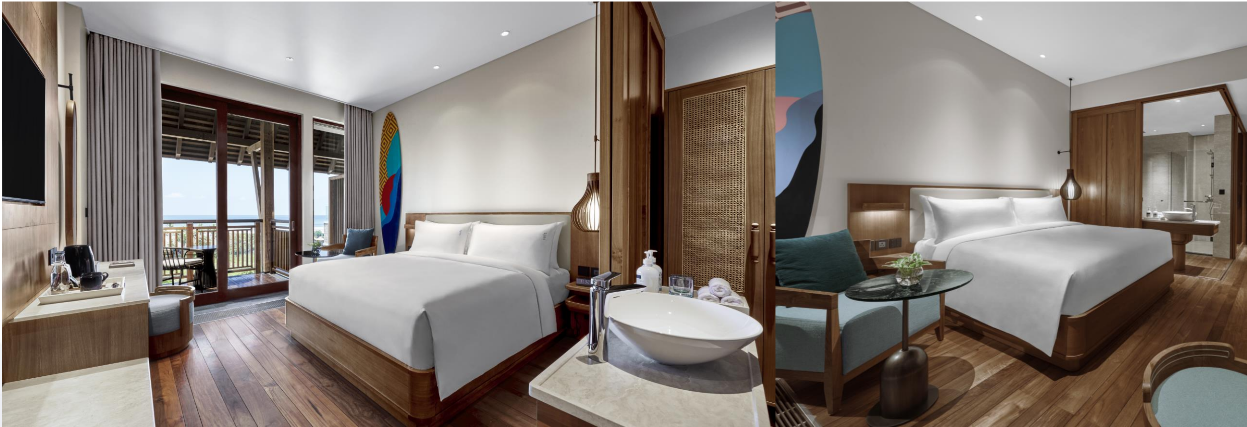
Standard King Bed

Step into a 32-square-meter haven of comfort, where a king-size bed with plush bedding and a selection of soft and firm pillows awaits. The room is not only spacious but also equipped for convenience and relaxation, featuring a 55-inch Smart TV, a functional work desk, stocked minibar, furnished balcony, and complimentary high-speed Wi-Fi. The walk-in shower adds a touch of elegance, and the room's tasteful decoration in soothing colours creates a serene atmosphere, perfect for both couples and solo travelers seeking to unwind in style.