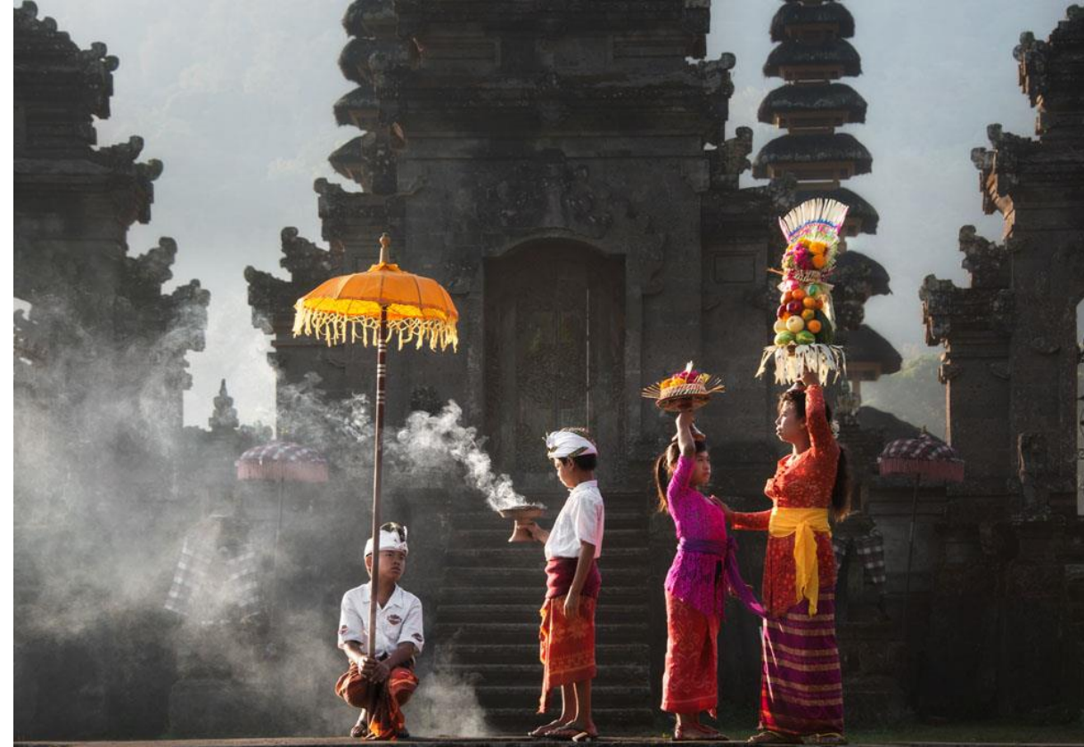
Local Experiences & Excursions

Canggu offers a wide range of activities, from surfing to lounging on the beach. Take a relaxing stroll along the beach or hit the waves for a thrilling surf session. There's certainly something for everyone at Canggu!