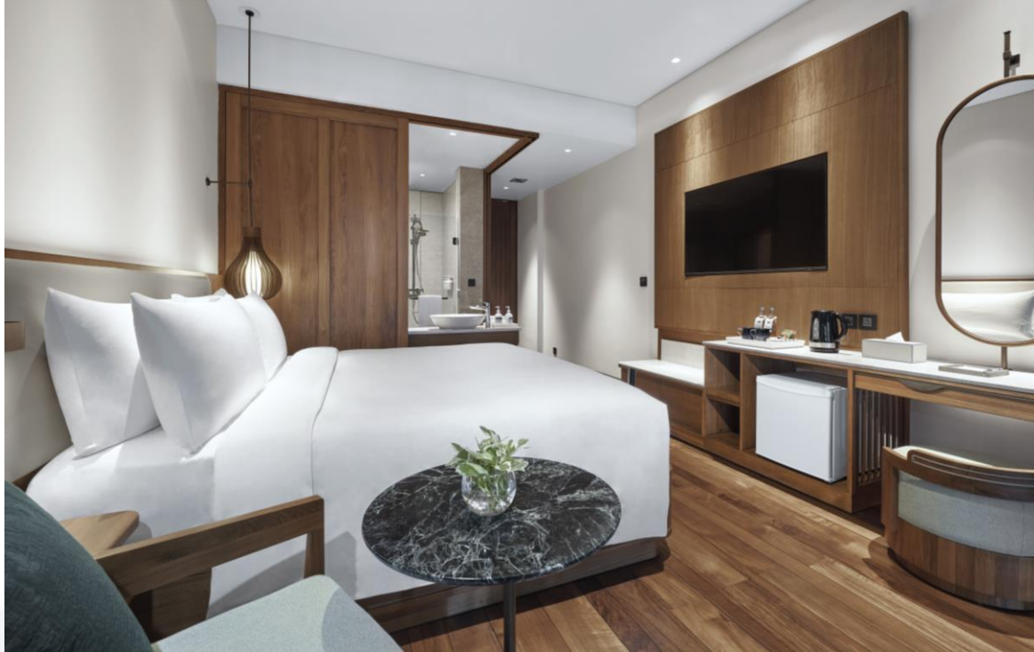
1 King Bed Standard Room