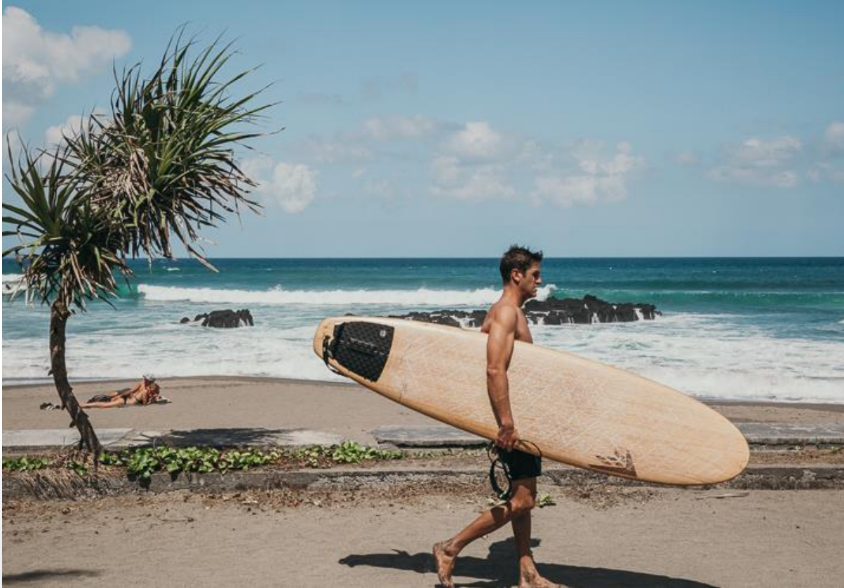
Explore the surroundings of Canggu, Bali

Canggu offers a wide range of activities, from surfing to lounging on the beach. Take a relaxing stroll along the beach or hit the waves for a thrilling surf session. There's certainly something for everyone at Canggu!