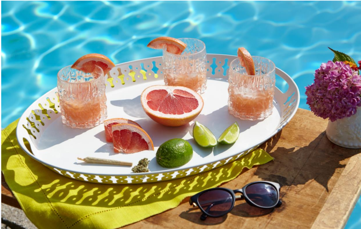
Unwind at our Pool Bar

Enjoy poolside relaxation with a refreshing cocktail in hand at our hotel's pool bar. Sip on tropical drinks, indulge in delicious bites, and soak up the sun in style. Groups can book out a private area for special events.