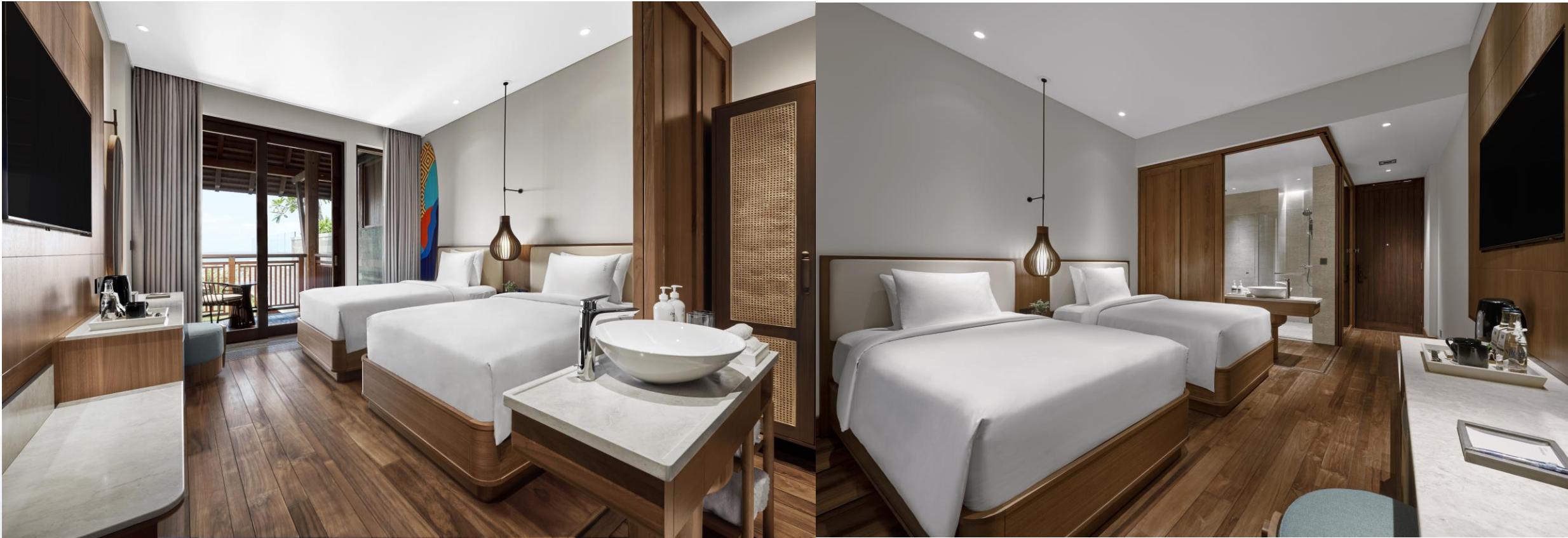
Standard Twin Bed

Experience comfort and style in our 32-square-meter standard twin bedroom, thoughtfully designed with two plush twin beds and essential amenities. This cosy space includes a private bathroom with walk-in shower, a convenient desk, ample wardrobe, Smart TV, stocked minibar, furnished balcony, and Wi-Fi, making it an ideal choice for individuals or pairs seeking a harmonious blend of convenience and comfort during their travels.