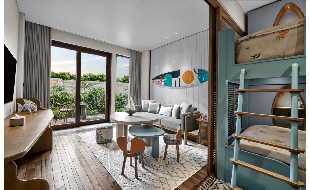
1 Bedroom Kids Suite

95 STANDARD KING-BED ROOMS | 39 STANDARD TWIN-BED ROOMS | 3 SUITES | 7 FAMILY SUITES