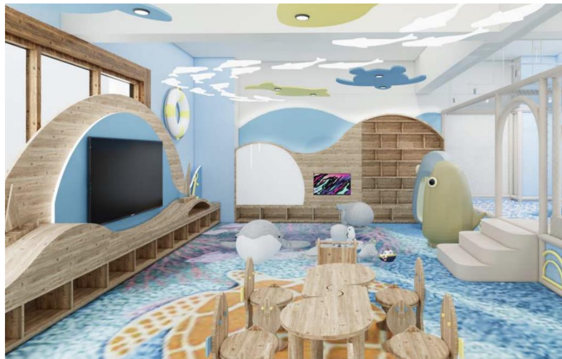
Kid's Club Ground Floor

Exciting adventures and entertainment await your little ones with our hotel's fun-filled kid's activities.