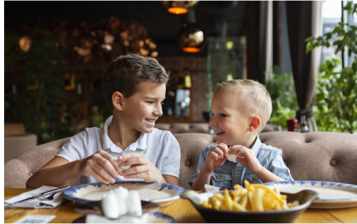
Kids Stay & Eat Free

Enjoy poolside relaxation with a refreshing cocktail in hand at our hotel's pool bar. Sip on tropical drinks, indulge in delicious bites, and soak up the sun in style. Groups can book out a private area for special events.