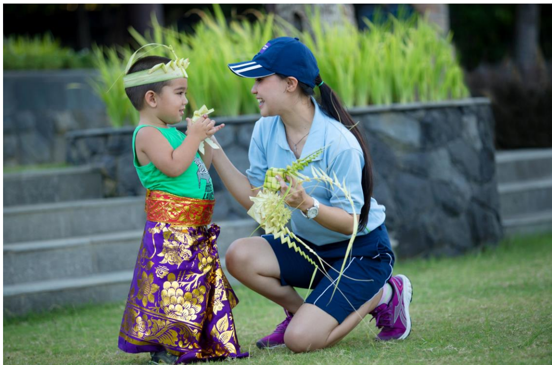
Exciting Kids Activities

Exciting adventures and entertainment await your little ones with our hotel's fun-filled kid's activities.