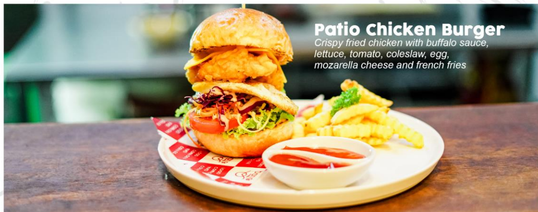
Patio Chicken Burger Crispy fried chicken with buffalo sauce, lettuce, tomato, coleslaw, egg, mozzarella cheese and french fries