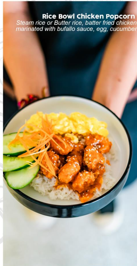
Rice Bowl Chicken Popcorn Steam rice or Butter rice, batter fried chicken marinated with buffalo sauce, egg, cucumber

Mushroom Rice Bowl 28K Steam rice or Butter rice, sauted mix mushroom with parsley and garlic