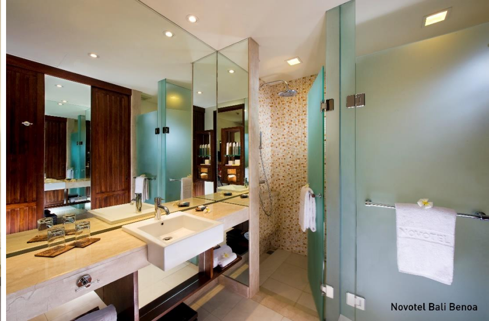
Novotel Bali Benoa