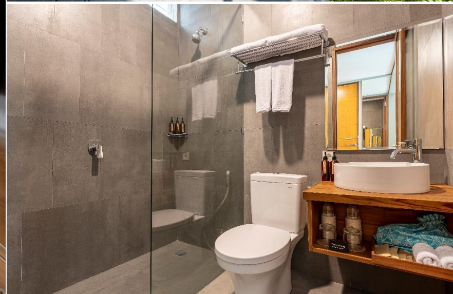
Deluxe Room with Private Garden