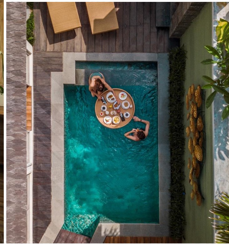
Two Bedroom Pool Villa