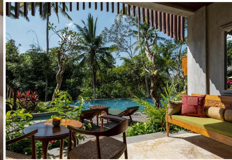
Arkamara Pool Terrace