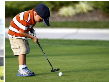
Free Kids Putting

Refresh your mind, body, and soul by jog while embracing the fresh cool mountain air and stunning view.