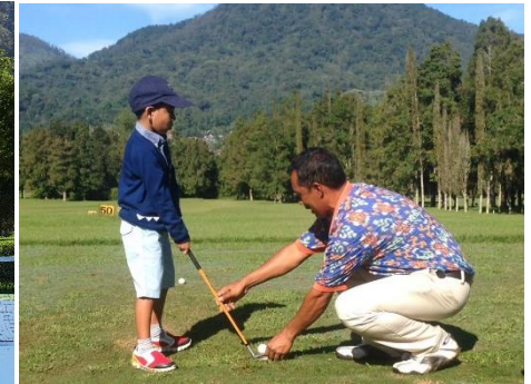
Free Golf Lesson

Play tennis in a cool weather while enjoying the splendor of beautiful mountain view. Perfect place to have a joyful tennis with family.