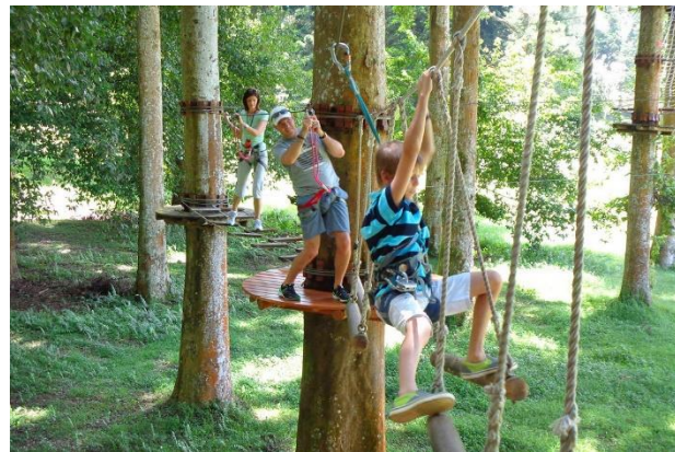
Bali Tree Top

Get affordable fresh vegetables in Bedugul traditional vegetables market. Approximately 10 minutes from Handara.