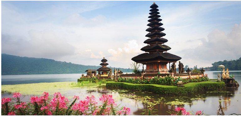
Ulun Danu Temple

One of the most famous Hindu Temples in the whole of Indonesia that was built in 1663. Approximately located 15 minutes from Handara.