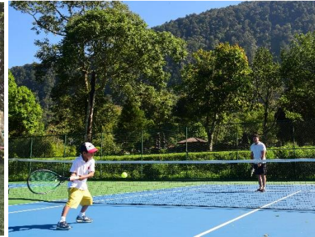
Caldera Valley Tennis Court

A unique kid's playground in the form of tree house. This tree house is estimated to come on stream on November 2018.