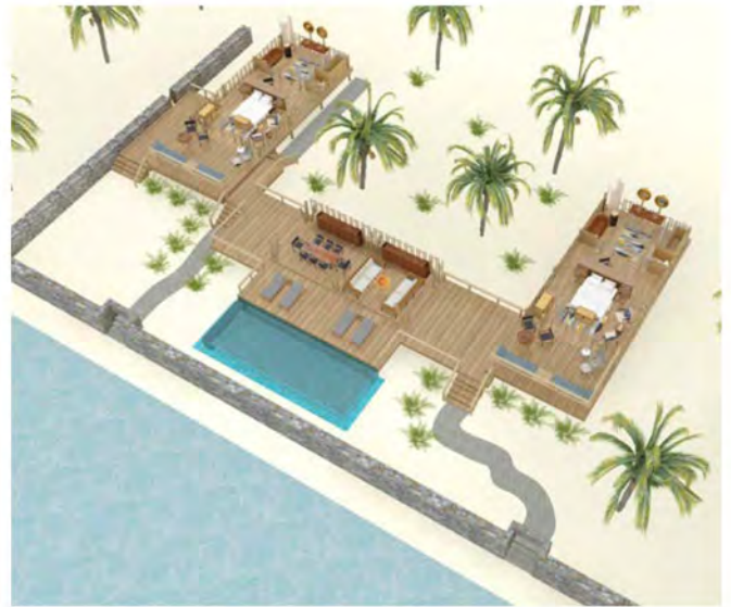
Two-bed Infinity Pool Villa