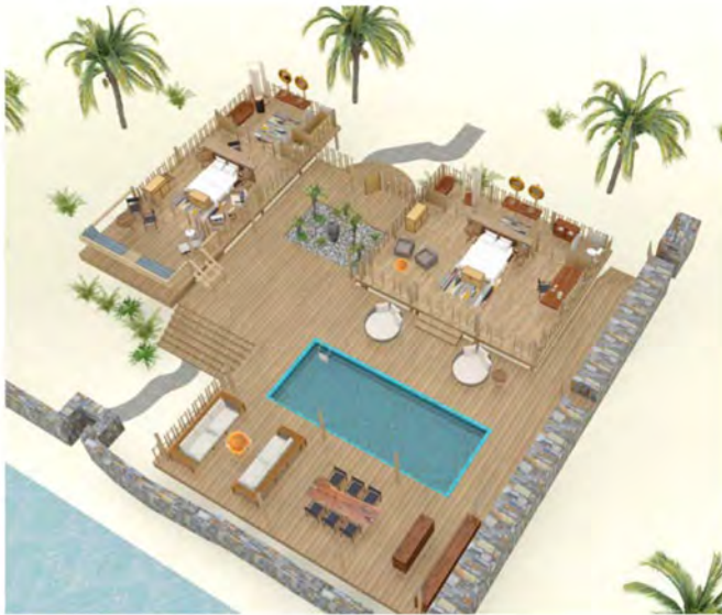
Two-bed Pool Villa