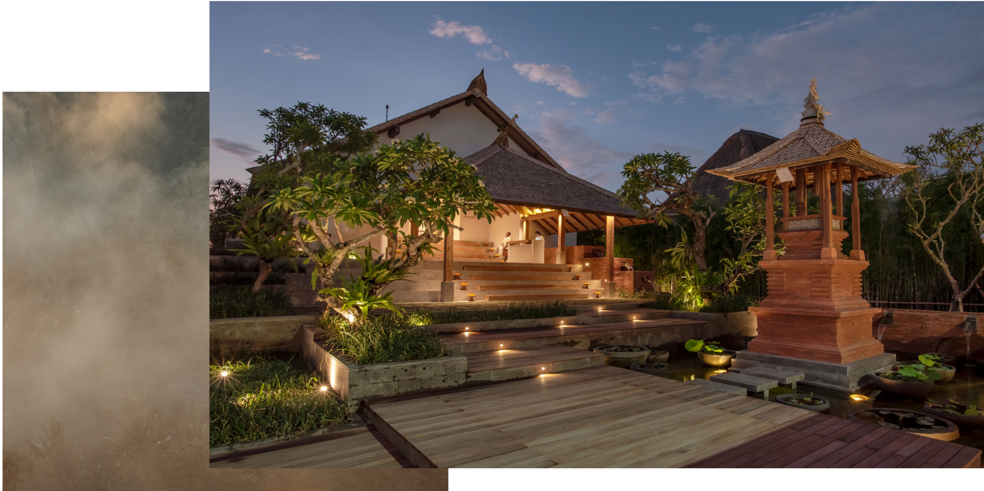
SEMINYAK BOUTIQUE AND GALLERY