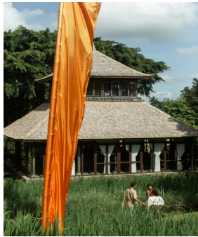
KAPAL BAMBOO, MAMBAL UBUD Opens daily from 10:00 AM to 6:00 PM